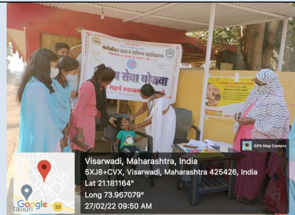
Anganwadi Asha workers were assisted by N.S.S. volunteers.