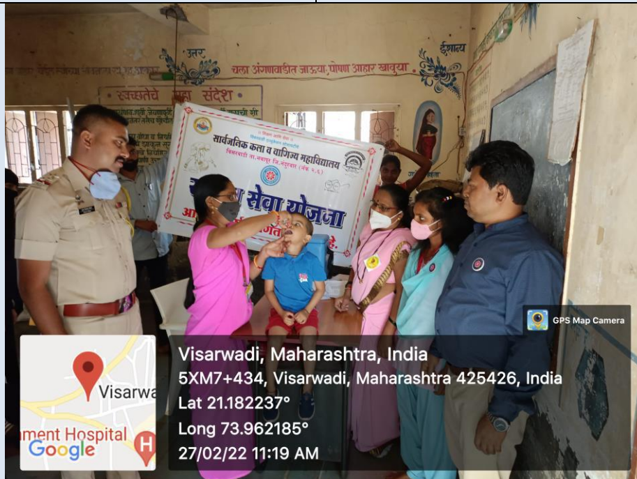
Police officer carried their duty while polio drops to his son.